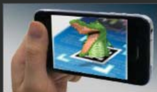
Augmented Reality Tools