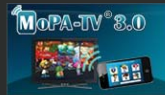
Mobile Participation TV