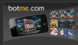
Mobile Games & Apps